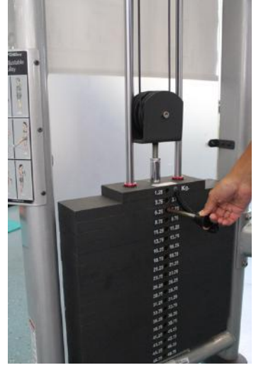
Pull out the handle for adjustment of the weight.