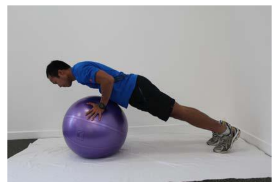
Lower yourself downward until your chest almost touches the ball. Press your upper body back up to the starting position while squeezing your chest.