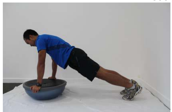
Turn a Bosu ball over, so that the halfball portion is on floor. Assume a pushup position and place your hands on the sides of the Bosu's platform. Brace your core and glutes.