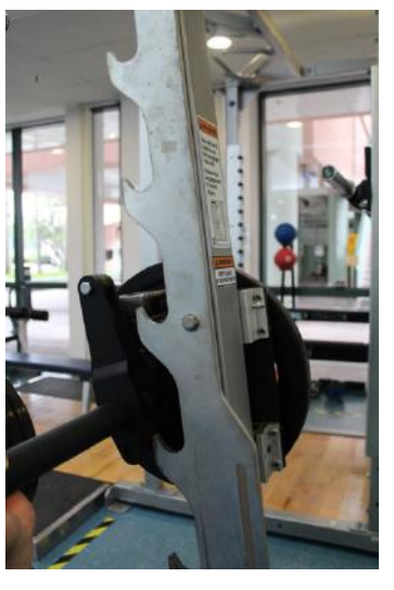
Stretch out the arms and turn the wrists to unhook the bar.