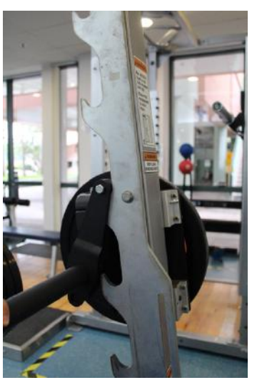
As the bar is still locked, lie down on the bench and position the hands on the bar.