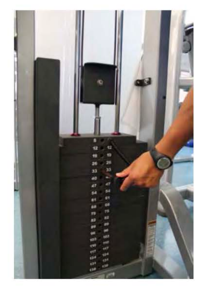
Pull out the handle for adjustment of the weight.