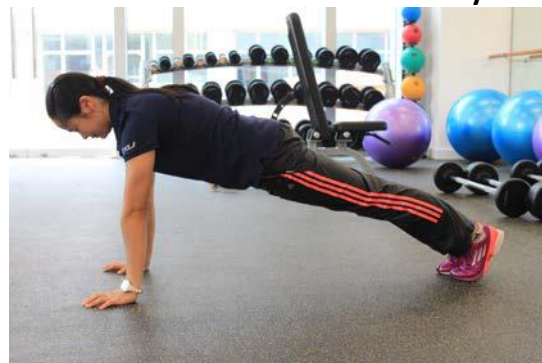
Lie on the floor face down and place your hands slightly greater than shoulder width apart while holding your torso up at arms length.