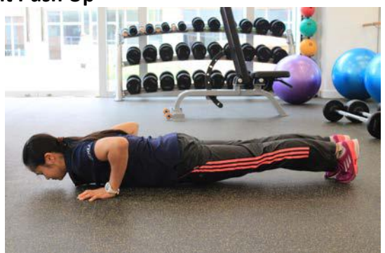
Lower yourself downward until your chest almost touches the floor. Press your upper body back up to the starting position while squeezing your chest.