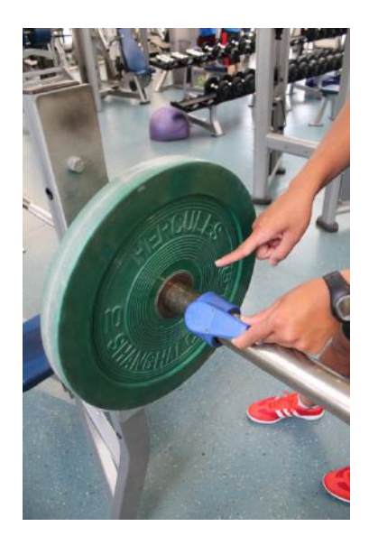
Add or remove weight plates for exercise. Use the clip to lock the weights.